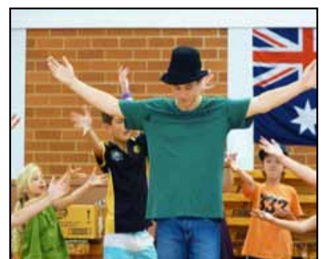
Above: Grenfell ArtStart street theatre and film making workshops. From video work to stop motion claymation and a lively performance in the main street of Grenfell. The workshops ran over four days January 17-20, 2012.

See more at: www.facebook.com/grenfellfestival