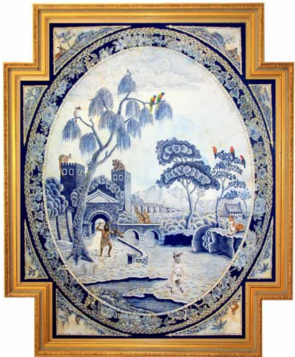
IMAGE: Danie Mellor, An All Encompassing Spectacle of Nature's Wonders, 2009, mixed media on paper, 163.0 X 131.5 cm, private collection, image courtesy the artist and Jan Murphy Gallery, Brisbane. This work features in the Bathurst Regional Art Gallery developed exhibition @ECLAIMED: Contemporary Australian Art.

Arts OutWest projects Local arts news 8 pages of events Workshops Funding opportunities Opportunities for artists