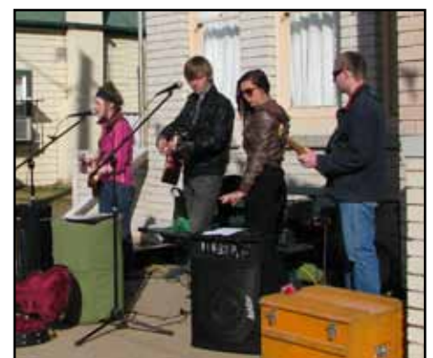
ON THE ROAD: (left) The Mulga Bill Bicycle Festival Art Exhibition and (right) young performers at the festival, Yeoval July 30. See more pictures from our travels on our www.facebook.com/artsoutwest page.

DISCLAIMER Articles appearing in Artspeak which are attributed to individuals do not necessarily express the views of Arts OutWest. All content, including event listing details, is sourced from the community and reprinted here and online in good faith. Arts OutWest accepts no responsibility for date, price, content or venue changes, or cancellation of events. Arts OutWest reserves the right to edit or omit contributions.