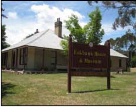
Above: Eskbank House and Museum.