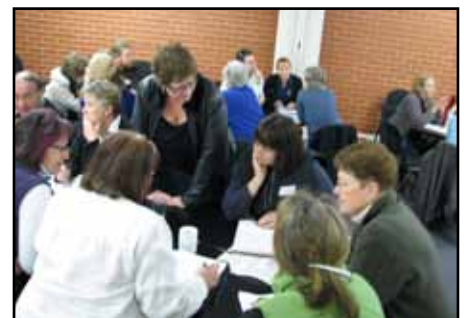
Above: The Regional Arts NSW funding workshop in Grenfell in 2009.

More info on the Regional Arts Fund at: www.regionalartsnsw.com.au/grants/raf.html