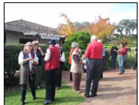
Above: Socialising over lunch at the Cowra Japanese Gardens.

Just over 40 people from right across the region came along for the lunch and meeting at the Cowra Japanese Gardens and most stayed on for the tour of the Calleen Art Award and Central West Regional Artists Award at the Cowra Regional Art Gallery. Thank you Cowra for the great day.