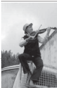
The "Fiddler on the Ute", Kowmung Music Festival.