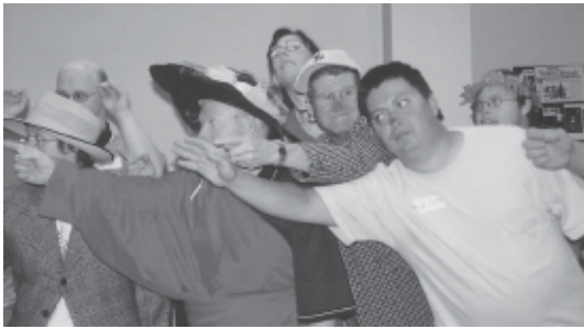
Theatre workshop, International Day of People with a Disability, Bathurst.

fell to the executive officer and finance and fundraising subcommittee of the Board. In addition the finance officer position continued to change with three different officers carrying the position over the year. However all financial reporting requirements continued to be met including preparation of quarterly accounts for the ATO and Board reports, budget reviews and acquittals of grants and funding.