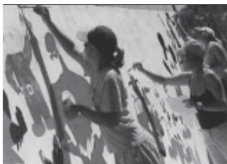
Cumnock mural project.