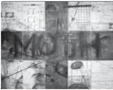
Formulae by Richard Goodwin, exhibited at the Orange Regional Gallery.