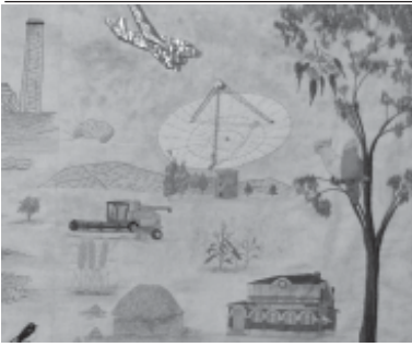
Parkes celebratory wallhanging, detail.