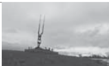
The Plough Sculpture at Condobolin, a Stories of the Central West project