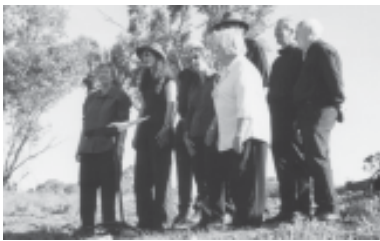
Wellington's acapella choir Stray Notes perform at the Burrendong Arboretum Sculpture Walk.