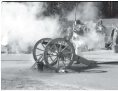
Firing off an old cannon at Lithgow's Ironfest.